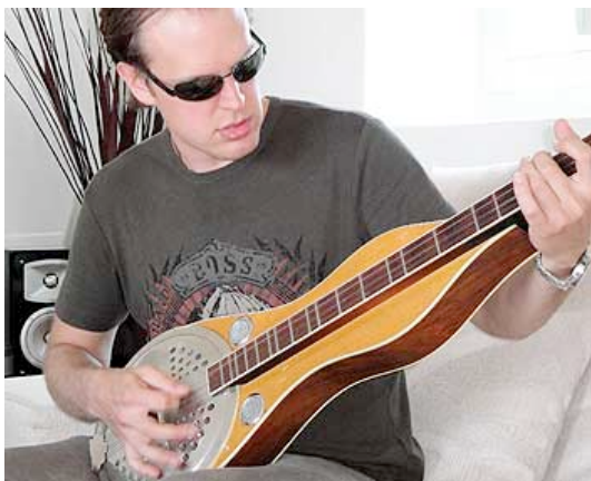
Joe Bonamassa with a Resonator Dulcimer at Black Rock