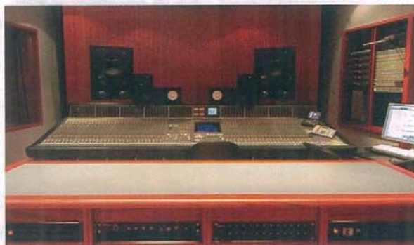
The Aurelius Room – the 45sq m 5+1 and 7+1 set-up – is part of Fast Forward’s expansion

Although both rooms have only been operational for a few months, Scarparo is already at work on the next upgrade to the Forward “sound factory” – another live room, adjacent to the Aurelius and